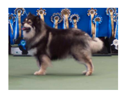
Limit Dog Winner RDCC

Tri colour Lacking substance and bone, he is a balanced dog longer than previous dog with a reasonable balance to his head proportions and a good eye. Coat okay, tailset high. Moved okay.