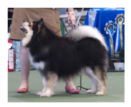
Veteran Dog Winner BVD

Brown /white 11 months has good skull developing eye harmonizing with his coat colour which is correct texture. Making his handler work to keep him focused on the job in hand. Friendly outgoing boy who moved okay when settled, would like his body a tad shorter for balance. Feet good and correct tail set.