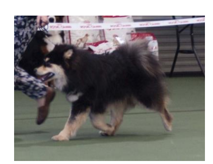
Novice Dog Winner

Two year old male of correct balance with a very good coat texture. Attractive head and expression. He could have more substance at two years of age. Needs more angulation front and rear for freer movement. Moved okay very short striding and not straight in hock.