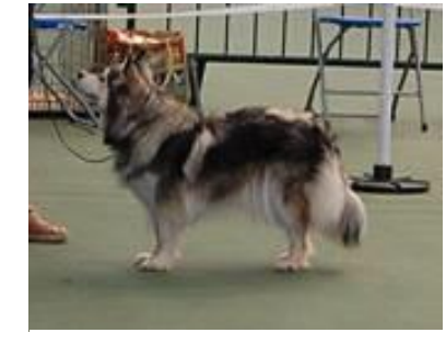
Novice Bitch winner