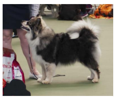
MPB winner Puppy Bitch Winner BPB BPIS