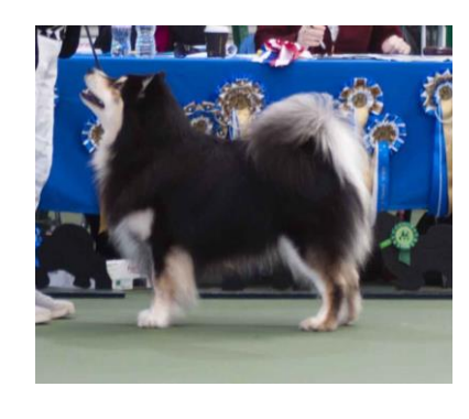
Open Dog Winner

A dog in good coat with unusual markings of correct texture. He is of smaller build but balanced. He moved well in profile a little loose in front and wayward on the up and down. Needs more definition in head, tad long in muzzle eyes and ears okay. Moderate angulation.