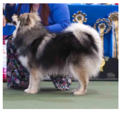
Puppy Dog Winner Junior Dog Winner BPD BOSPIS